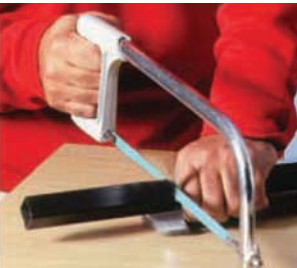
Make a sketch of the item you need and cut the tube to the required lengths