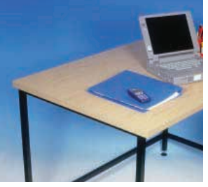
Complete your design