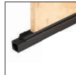
Cladding and glazing extrusions