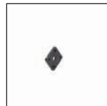
Plastic shelf spacer