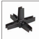
5-way corner joint