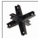
6-way corner joint