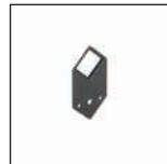
Single shelf support