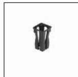
Black, White or Clear Inserts