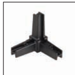
3-way corner joint