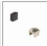
End caps - plastic or metal