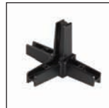
4-way corner joint